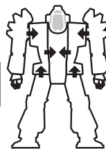
Damage Transfer Diagram